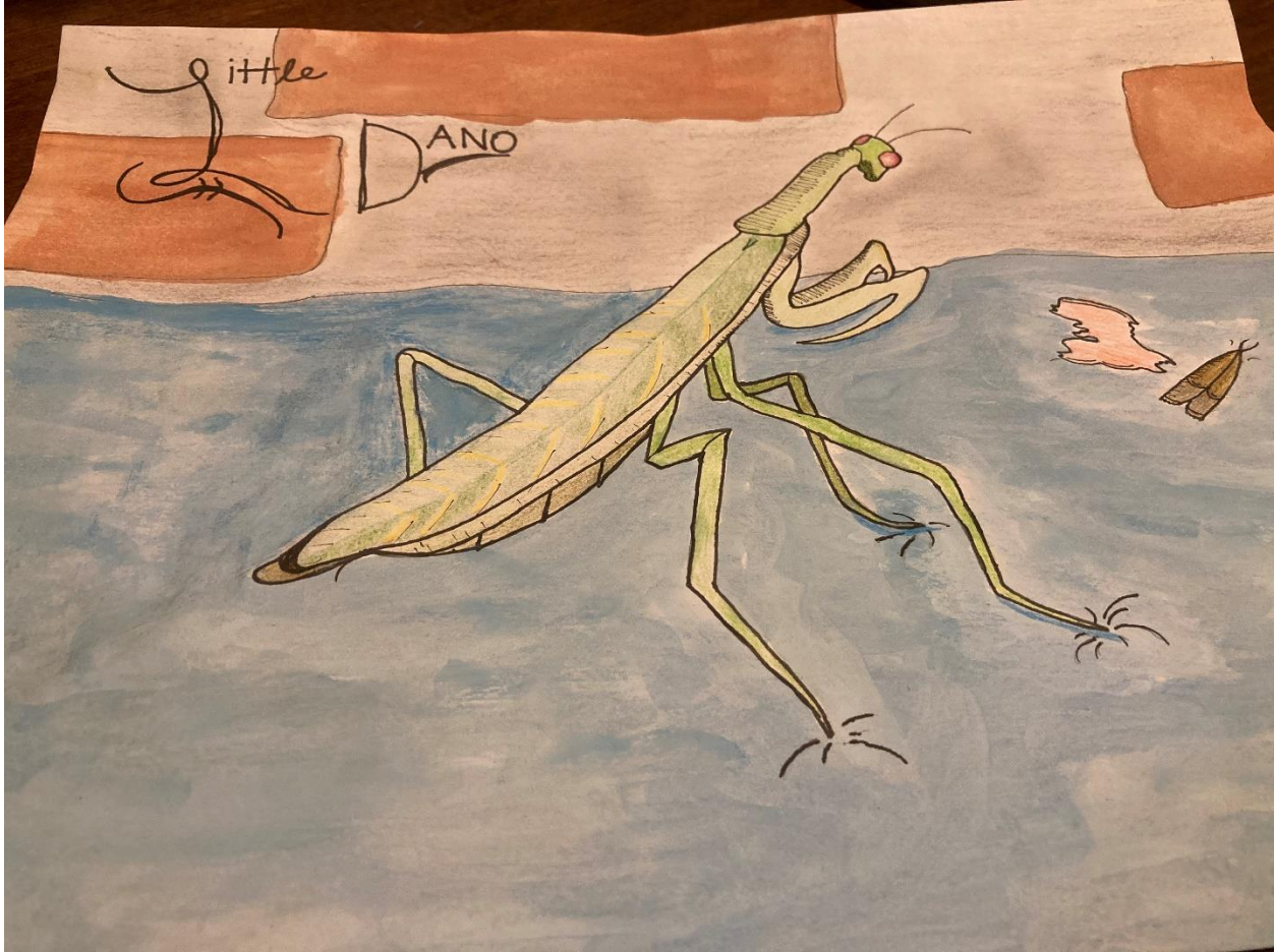
[image description: drawing of "Little Dano" a green mantis on a blue and brown background by Caitlyn Whitfield]